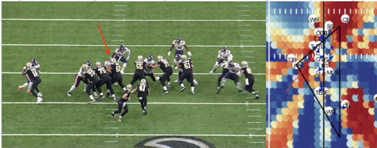
Figure 3: Center Max Unger blocks for Running Back Alvin Kamara. Kamara gained only 2 yards on the play.

Unger claims a top five SpaceGrade ranking for centers despite being the 31 st highest graded run blocker by Pro Football Focus, the largest discrepancy among all centers. This play only gained 2 yards due to poor performance from the right half of the offensive line, as well as the tight end. However, Unger performs his duties quite well. Plays like this are a perfect example of the current discrepancy in the evaluation of offensive lineman and their actual performances.